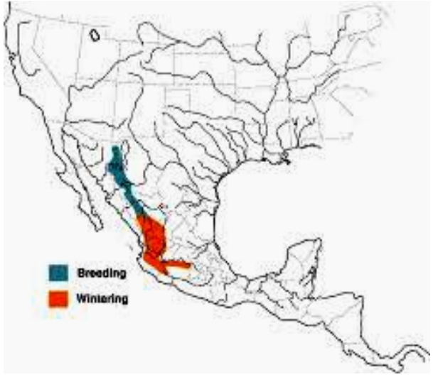
Illustration 1: Parrot Migration

In the early morning of the 28<sup>th</sup> of October 2018, I was here in AZ not far from my home in the desert in SE Arizona. I looked up in this dream-vision and saw thousands of birds swarming, circling and then slowly beginning to fly to the south-east of my location.